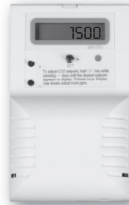
Optional CO 2 -400 CO 2 controller

CO 2 (carbon dioxide) is needed by plants for proper growth. In an indoor environment it is quickly depleted, which slows or even stops growth. CO 2 can be added by either a cylinder of CO 2 or by burning cheaper and easier to obtain propane or natural gas. Under ideal combustion, only CO 2 and water vapor are produced. A furnace burns gas, uses the heat, and discards the combustion gases. A CO 2 generator generally does the opposite - it uses the combustion gases (CO 2 ) and discards or redirects the heat. A furnace is optimized for maximum heat, a CO 2 generator for cleanest CO 2 . CO 2 generators are best suited for larger grow rooms with temperature and humidity under good control. The Gas Pro is designed to be controlled by a timer or CO 2 controller. It is not designed for continuous operation.